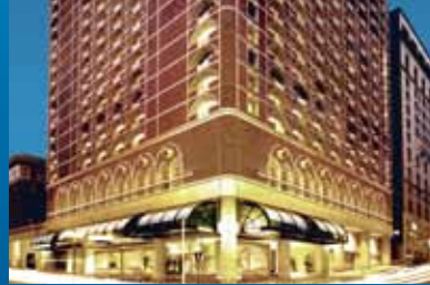
Pan Pacific Hotel San Francisco, USA

Colliers provided strategic guidance and key valuations to International Hotels Investments plc. (IHI) surrounding a potential London-based IPO of IHI's luxury hotel portfolio.