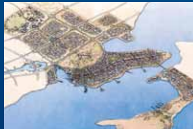
Al Uqair Development Saudi Arabia

Colliers valued this 299-room world-renowned hotel for acquisition purposes.