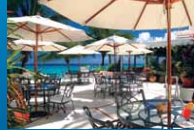
Fairmont Royal Pavilion St. James, Barbados

Our experts sold this full-service 327-room hotel in the heart of San Francisco.