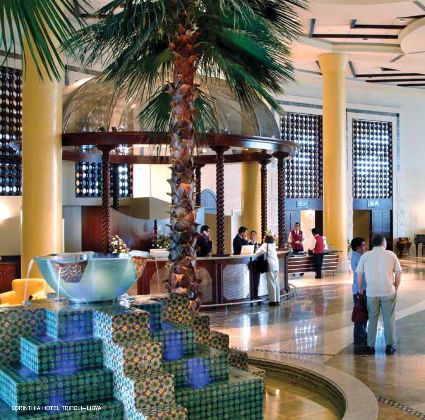
CORINTHIA HOTEL TRIPOLI—LIBYA