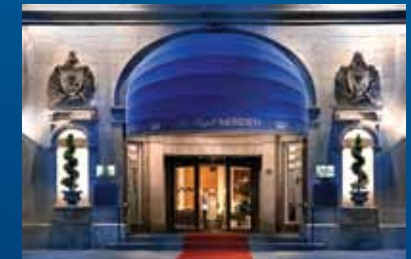
Le Meridien King Edward Hotel Toronto, Canada

For the English National Football Centre we assisted with hotel concept development, market and financial feasibility, operator selection and obtained forward funding.