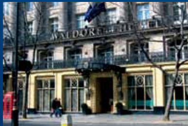
Waldorf Hotel London, UK

Colliers is the principal valuer for the Regal REIT portfolio, which includes this 1,100-room Hong Kong airport hotel.