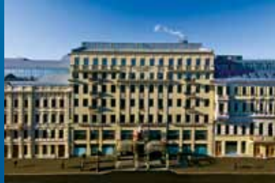
Corinthia Hotels Europe, Middle East and Russia

Colliers provided strategic guidance and key valuations to International Hotels Investments plc. (IHI) surrounding a potential London-based IPO of IHI's luxury hotel portfolio.