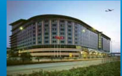
Regal Airport Hotel Chek Lap Kok Airport, Hong Kong

Working together, our London and Toronto offices negotiated the sale and manage-back of this luxury resort with private beach and excess land suitable for development.