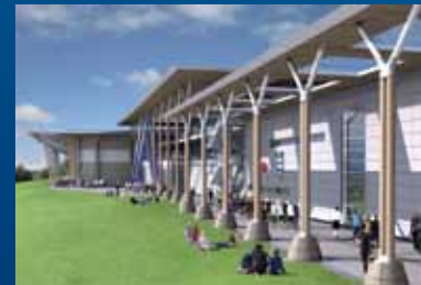
St. George's Park Burton Upon Trent, UK

We provided an outline feasibility study and land valuation for the first phase of this proposed hotel and mixed-use development.