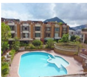
No.45 Island Road, Deep Water Bay Sold for HK$80 million