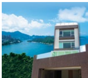
Manly Villa, Shouson Hill Sold for HK$174 million