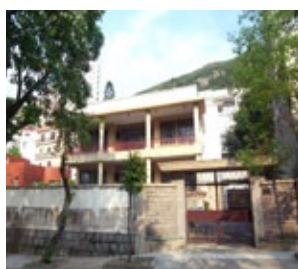
No. 73 Perkins Road, Jardine's Lookout Sold for HK$230 million