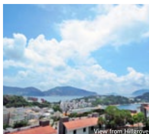
Hillgrove, Chung Hom Kok Sold for HK$65 million