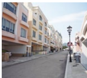
Redhill Peninsula, Tai Tam Sold for HK$57 million