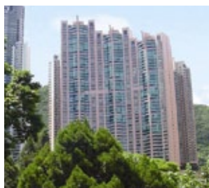
Dynasty Court, Mid-Levels Sold for HK$77 million