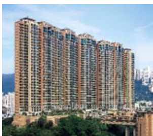
The Leighton Hill, Happy Valley Sold for HK$52 million