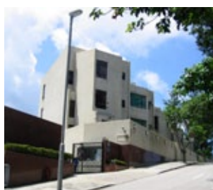
The Beachfront, Repulse Bay Sold for HK$92 million