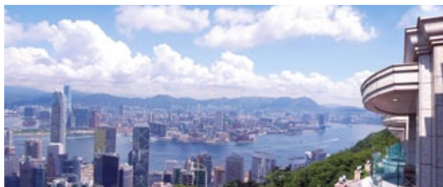
No.8 Severn Road, The Peak Sold for HK$155 million