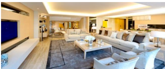
The Hampton, Happy Valley Sold for HK$81 million