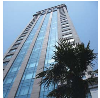
Cross Tower 高腾大厦 Investment Services, Sole Office Leasing Agency & Asset Management 投资服务、独家办公楼 租赁代理及资产管理 (50,200 sq m / 平方米)