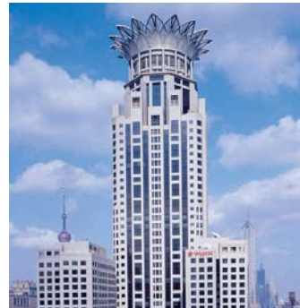
Bund Center 外滩中心 Property Management 物业管理 (190,000 sq m / 平方米)