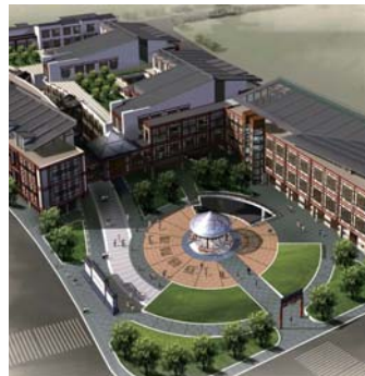
Dragon Gate Mall 豫龙坊 Investment Services, Retail Advisory & Asset Management 投资服务、零售商业定位顾问及 资产管理 (36,000 sq m / 平方米)