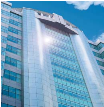
686 Jiu Jiang 宝龙大厦 Sole Office Leasing Agency & Asset Management 独家办公楼租赁代理及 资产管理 (27,800 sq m / 平方米)