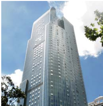
The Exchange 东海广场一期 Sole Office Leasing Agency 独家办公楼租赁代理 (76,000 sq m / 平方米)