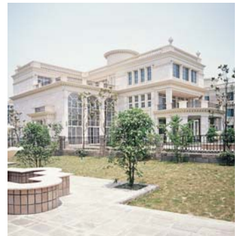
Tomson Golf Villa 汤臣高尔夫花园 Property Management 物业管理 (263,000 sq m / 平方米)