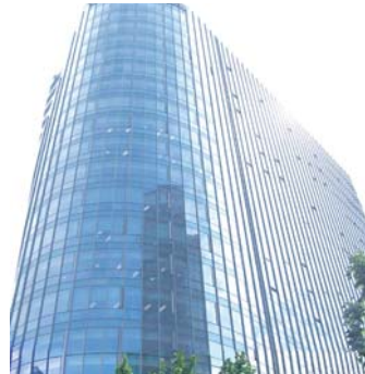
Platinum 新茂大厦 Investment Services, Sole Office Leasing Agency & Asset Management 投资服务、独家办公楼 租赁代理及资产管理 (34,000 sq m / 平方米)