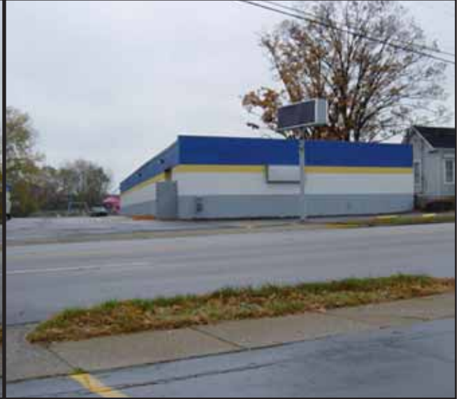
10209 Taylorsville Road