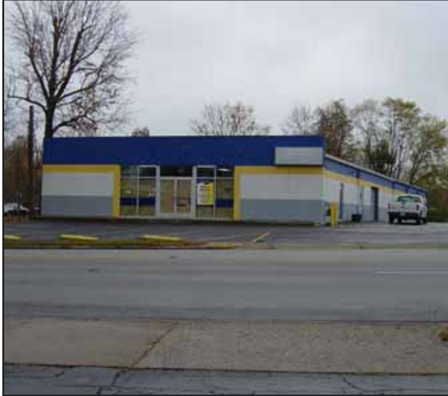
10207 Taylorsville Road

10207-09 Taylorsville Road Louisville, Kentucky