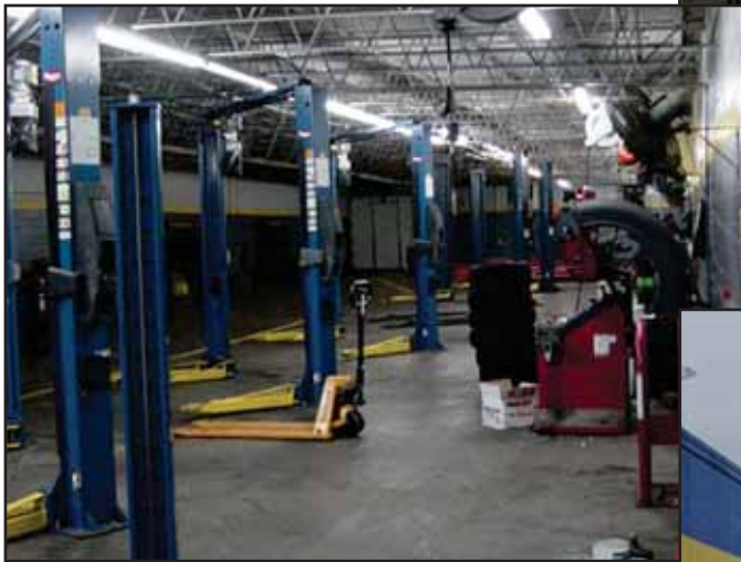
10209 Taylorsville Road - Auto Repair