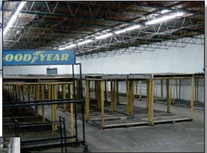
10207 Taylorsville Road - Warehouse