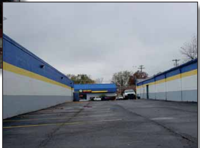
View Toward Taylorsville Road

Timothy B. Gramig (502) 394-2504 (direct) tgramig@colliershkm.com