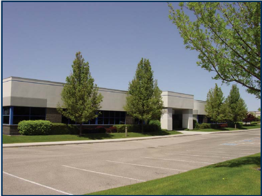
8757 Emerald • Boise, Idaho