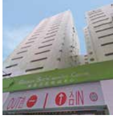
Goodman Shatin Logistics Centre, Fo Tan Sold 300,000 sq ft