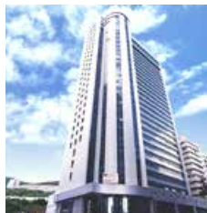
Sino Favour Centre, Chai Wan 330,000 sq ft Sole Marketing Agent