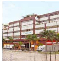
Jing Hin Industrial Building, Kowloon Bay Leased 118,000 sq ft