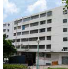
Block A, 24-26 Sze Shan Street, Yau Tong Sold 76,400 sq ft