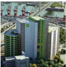
Interlink, Tsing Yi 2.4 Million sq ft Joint Sole Marketing Agent