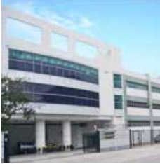
No. 2 Chun Yat Street, Tseung Kwan O Ind. Estate Sold 360,000 sq ft