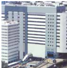
Hutchison Logistic Centre, Kwai Chung Leased 260,000 sq ft