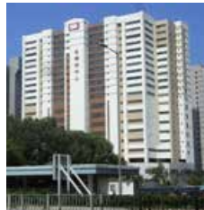
Ever Gain Centre, Shatin Leased 120,000 sq ft