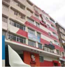
Block B, 24-26 Sze Shan Street, Yau Tong Sold 84,700 sq ft