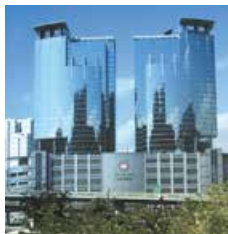
Ever Gain Plaza, Kwai Chung 1 Million sq ft Joint Sole Marketing Agent