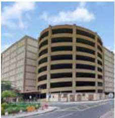
Sunshine Kowloon Bay Cargo Centre, Kowloon Bay Sold 69,700 sq ft